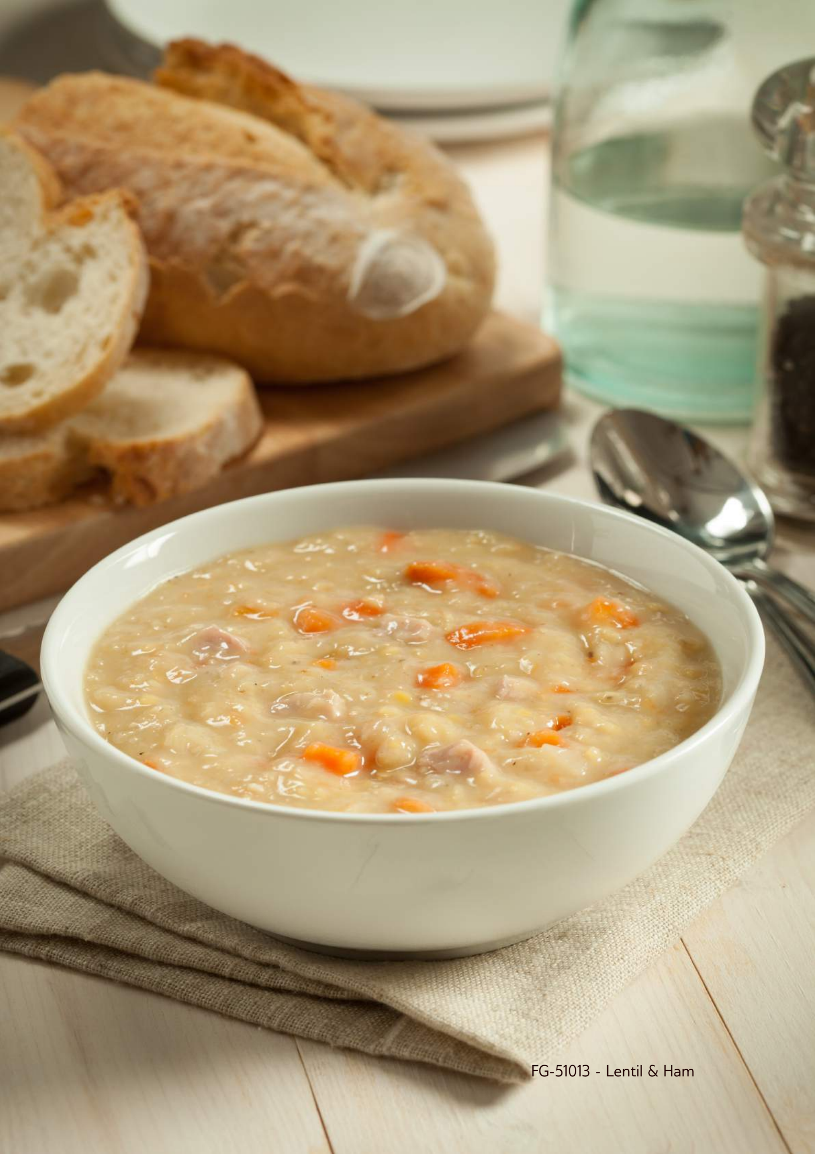
FG-51013 - Lentil & Ham